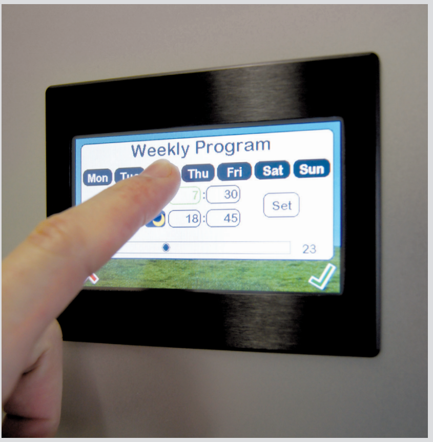
Easy touch screen interface